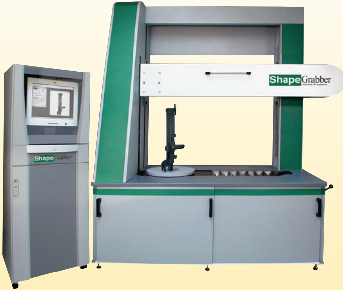
The ShapeGrabber Ai810 scanning an automotive radiator component

Rapid and efficient inspection scans also reduce production equipment downtime, material waste, and human inspection error.